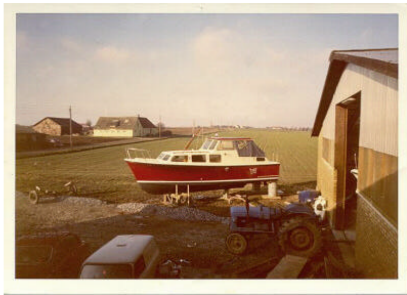
The Jupiter Warf 1973

In 1973 The Warf participate in yet another Boat show in Bella Center Copenhagen. They sell three boats.